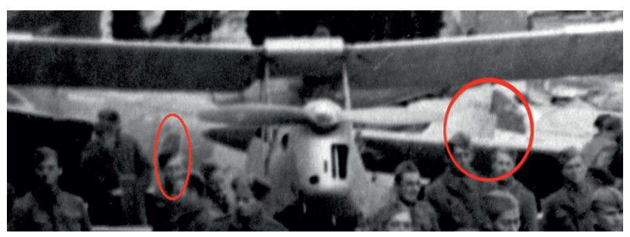
Photo made at the apron of Zemun aerodrome in March 1945. Seen behind are a de Havilland DH.60III Moth Major and Fw 190 F-8 with typical German style "black 1" and Yugoslav tricolor with red star on the rudder.